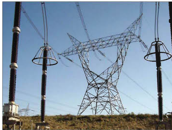
First tower of the 22 km - 400 kV line

A measurement on a 400 kV overhead line with a total length of 22 km has been performed at a large utility. The reason for the test was a false trip that was subject to closer investigation. Although the single-pole error arises at a transformer at the end of the line, the distance protection relay at the other end of the line trips. Why?