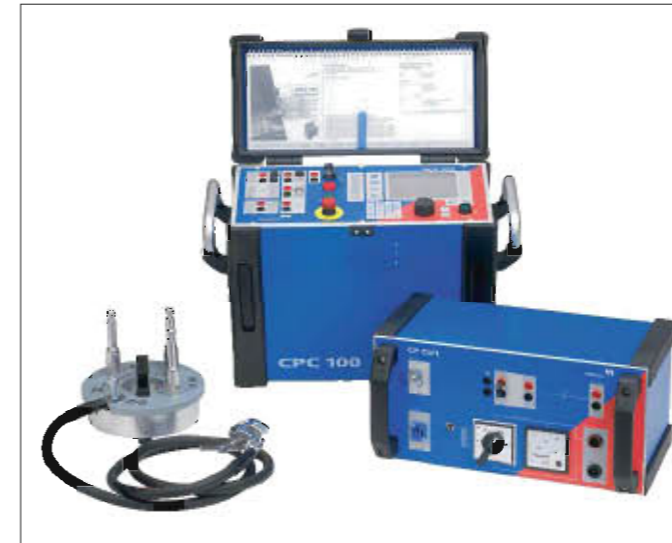
OMICRON's CPC 100 and CP CU1

Due to the variable frequency generation it is possible to generate signals first under then over mains frequency. Using digital filter algorithms allows measuring frequency selective at the frequency that is currently generated, this means all other frequencies but the generated one are filtered out. Disturbances at mains frequency are thus no longer influencing the result.